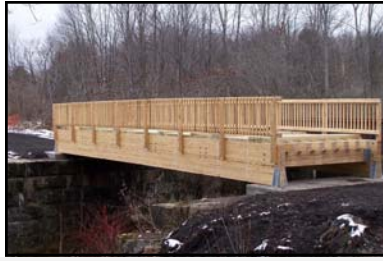
▲ The 43' bridge south of Route 305 ▲ ▼ 45' bridge near Gleason Hill Rd. ▼