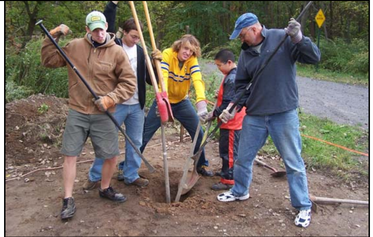
It's a tough job, but these fellows can handle it!