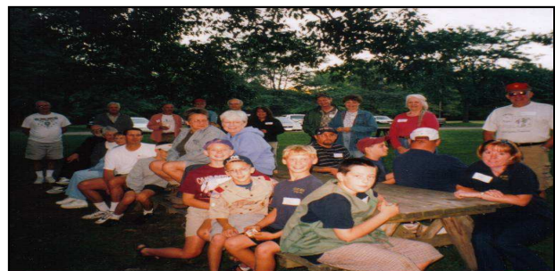
About 45 volunteers enjoyed the first picnic at the Parade Grounds in September 2003