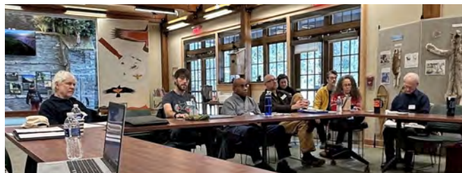
The February 23 Trail Town Networking Meeting provided an opportunity for conversation and learning for stakeholders from throughout the 90-mile Greenway corridor.

Nature Center. The meeting was attended by representatives of Livingston County and Allegany County Planning and Development, NYSDOT, Community Foundation for Greater Buffalo, Ralph C. Wilson Jr. Legacy Fund, Southern Tier West Regional Planning and Development Board, Genesee Country Village and Museum, OPRHP Allegany Region, InSite Architecture, Leadership Allegany, Livingston County Dept. of Tourism and Economic Development, and Alfred State College as well as Trail Town committee members and Trail Town Initiative partners LGV, PTNY, FOGVG, and GVG State Park.