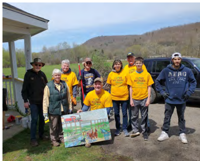
ILMPD 2022 Cuba Trail Town Committee volunteers removed a dump truck full of brush, weeds, and litter from the trail and trailhead. They also painted the trim on the trailhead gazebo and all the trail gates.