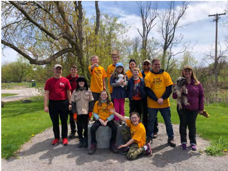
32 volunteers cleaned up the trail in Scottsville in 2022 See page 3 for a full list of 2023 ILMPD work sites throughout the Greenway corridor.

Genesee Valley Greenway State Park will be bursting with events throughout the year, but the Friends of the Genesee Valley Greenway (FOGVG) will kick off the season by celebrating the 12th annual I Love My Park Day (ILMPD) on May 6 . FOGVG volunteers will join with thousands of others across the state to “give back” by helping to maintain, enhance and bring greater visibility to New York’s treasured state parks and historic sites.