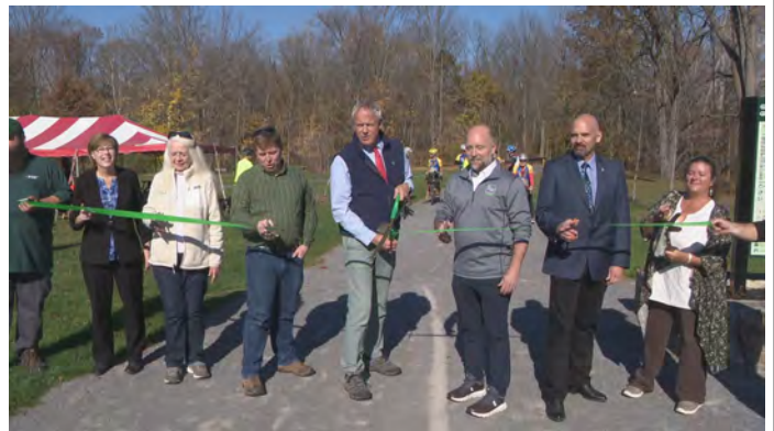
Cutting the Ribbon on 17 miles of refurbished trail Canawaugus Park, Scottsville