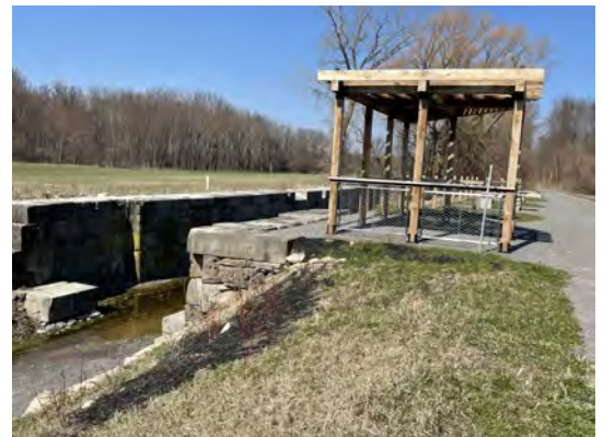
Genesee Valley Canal Lock #2