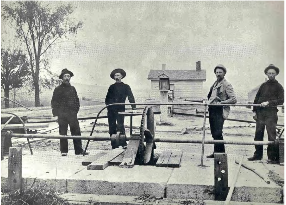
Lock Tenders at Erie Canal Lock #61, Macedon

Be "green" and receive the Greenway News earlier. Send your name and email address to fogvg@frontiernet.net