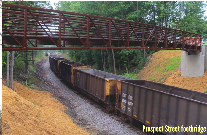
Prospect Street footbridge