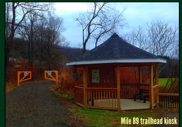
Mile 89 trailhead kiosk