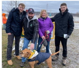
[Center] Attica Erie Avon First Day Hike.