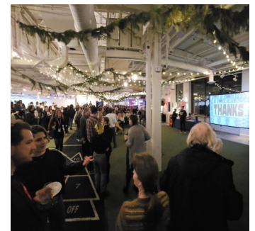
Best of Rochester Awards Party at Radio Social.

The Genesee Valley Greenway was a finalist in City Magazine's Best of Rochester Awards as one of the Best Biking Trails! The nomination was in the best of Recreation category. While the Greenway didn't win the category (the Erie Canalway Path won!), we are happy to have been nominated and we look forward to next year's polls! Radio Social hosted the City Magazine awards show on January 4th, and attendees enjoyed food, drinks, gaming, raffle prizes and of course, the January issue was hot off the press! Thanks for the nomination, Rochester!