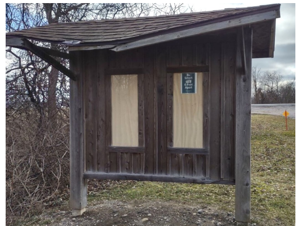
Caledonia Kiosk (Route 20 trailhead)

Pruning and Brush Clearing at Oakland Locks viewing area and gate painting at various locations along the Greenway!